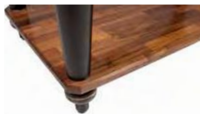
LOWER WALNUT SHELF