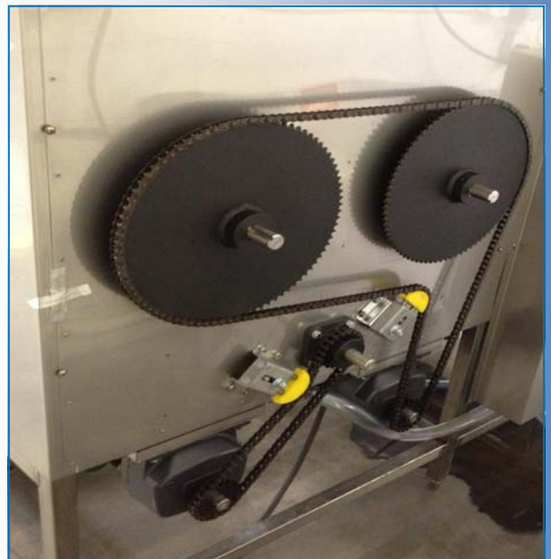
Chain Driven Augers & Agitators