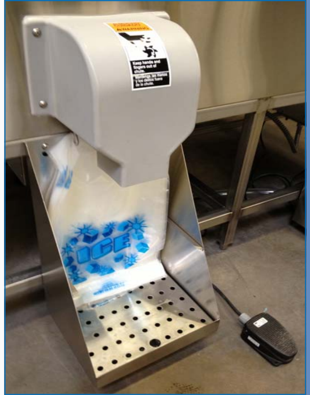
Ice Dispensing Stations