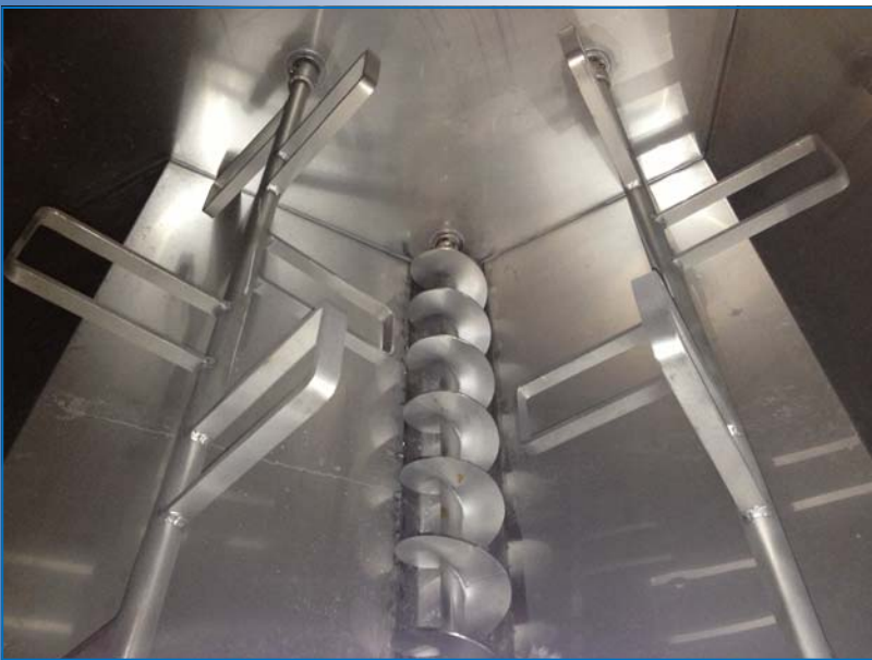
Ice Auger and Agitators