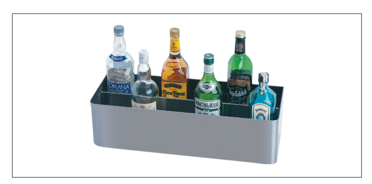
D-24 DOUBLE SPEEDRAIL SHOWN