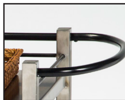
Black Epoxy Coated Push Handles and Shelf Rails