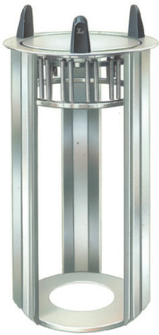
Model 4009 Open