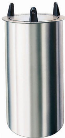
Model 5009 Shielded