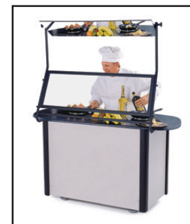
Optional breath guard and demo mirror

Measurements in ( ) denote metric millimeters, unless otherwise specified. OA height with breath guard is 57 1/2" (1461); OA height with demo mirror is 78 3/4" (2000).