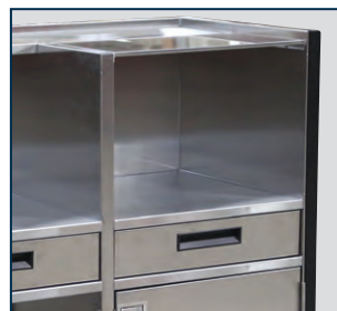
Compartment for touchscreen terminal has clear top shield for protection from elements.