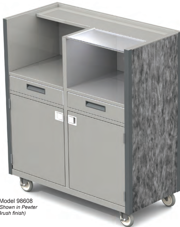
Model 98608 (Shown in Pewter Brush finish)