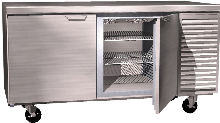
2067-ST shown with options