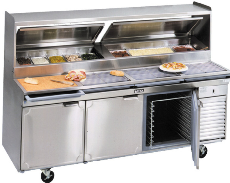
2586-PTB shown with options (pans not included)

Bloomington-Style Pizza & Sandwich Table - Raised Rail Top Self-contained