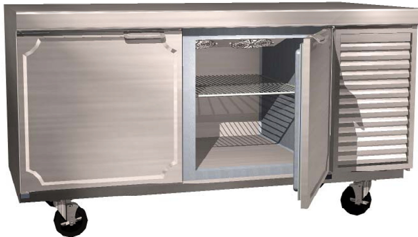
2562-ST shown with options