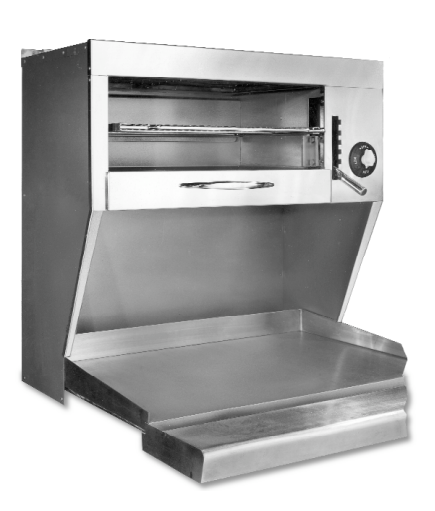
Model 136SB mounted on griddle-top range