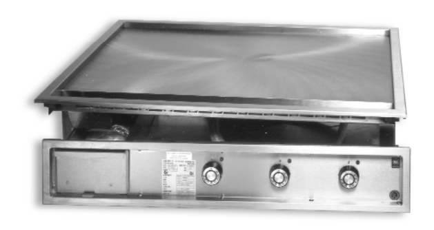
Model 136TDI shown