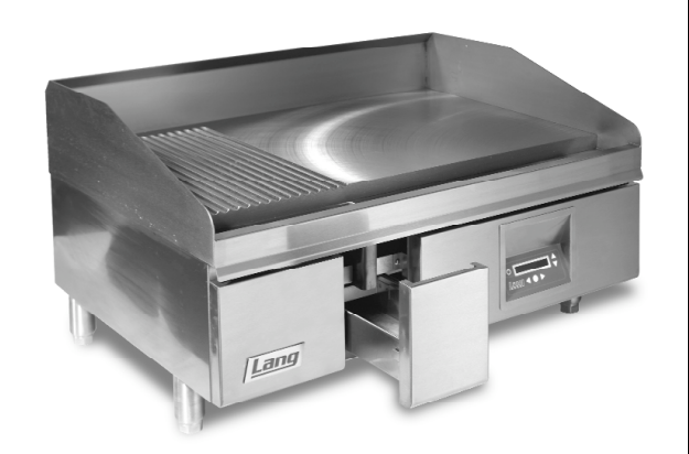
Model 236Z shown, with optional grooved plate section