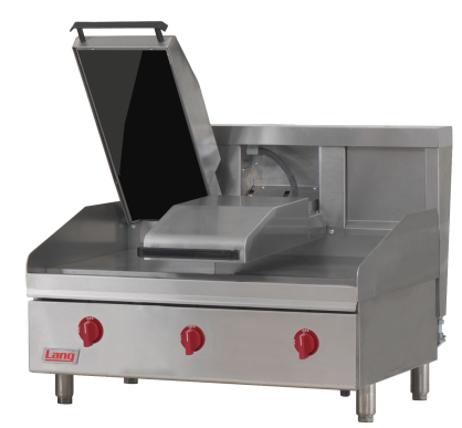
Model 248ZT Shown with optional CSE12AG flare reduction shield