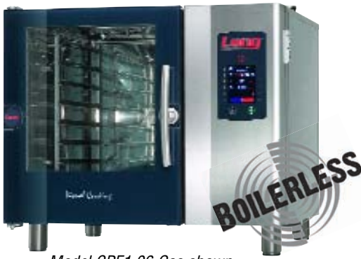
Model CPE1.06 Gas shown (counter model)