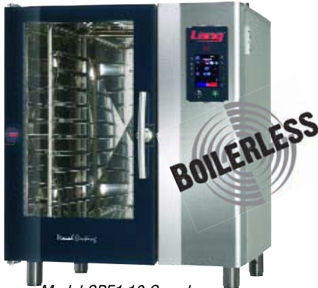
Model CPE1.10 Gas shown (counter model)