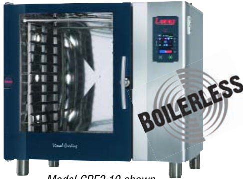
Model CPE2.10 shown (counter model)