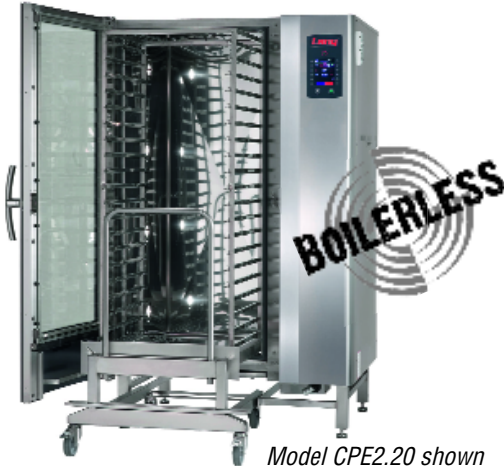
Model CPE2.20 shown