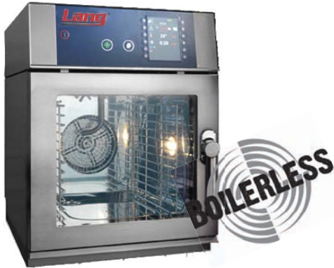
Model CSCPE23.06 shown (counter model)