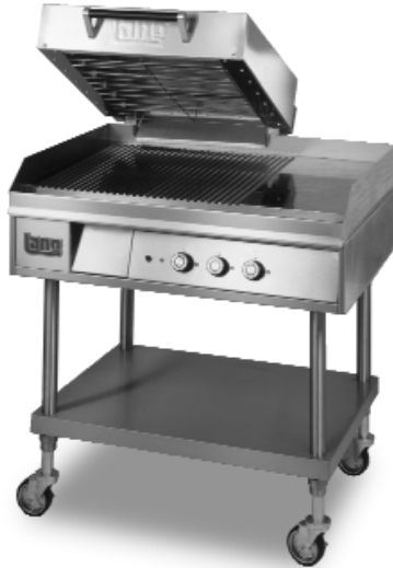
Model 136TH with optional grooving and optional ES-G36C stand