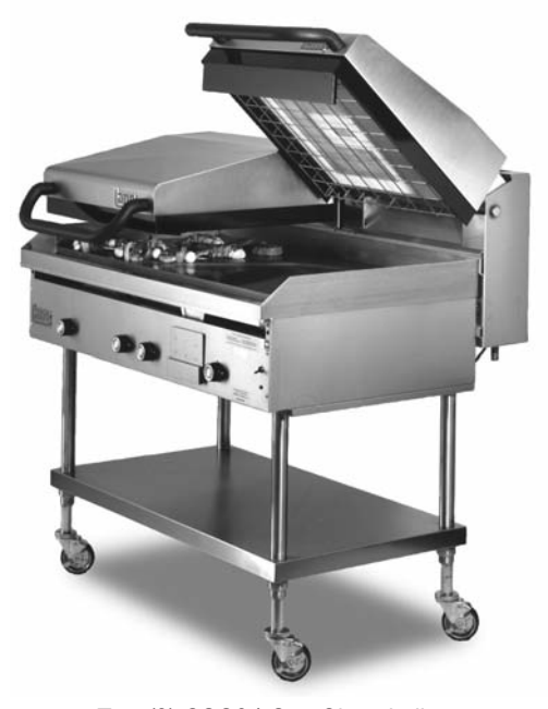
Two (2) CSG24 Gas Clamshells mounted on a model 248T Griddle with optional ES-G48C stand