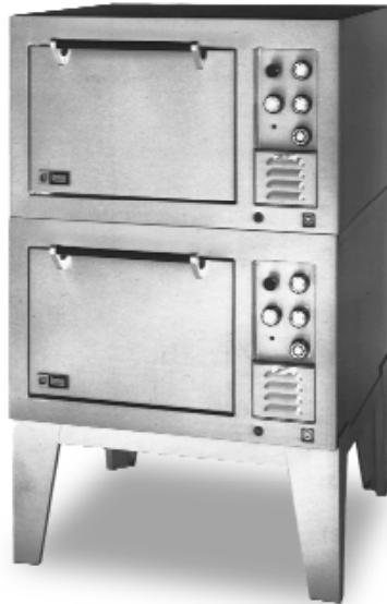
Model D0362 shown