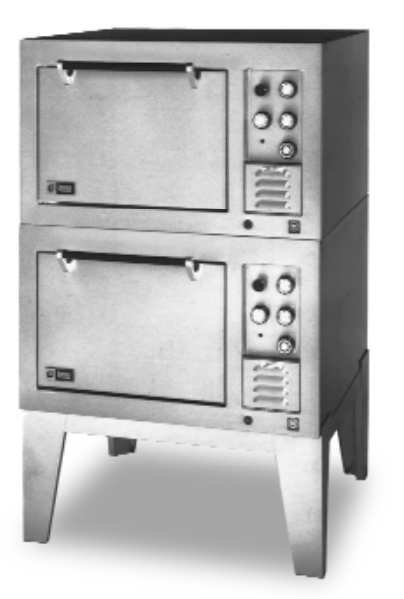
Model DO362 shown