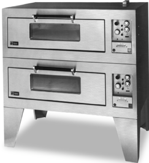
Model D054B2 shown