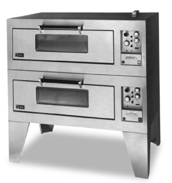
Model D054B2 shown