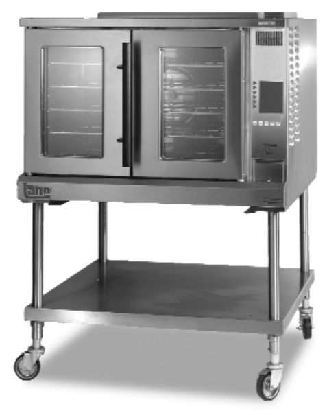
Model ECOD-PT2 shown, with optional 27" stand.