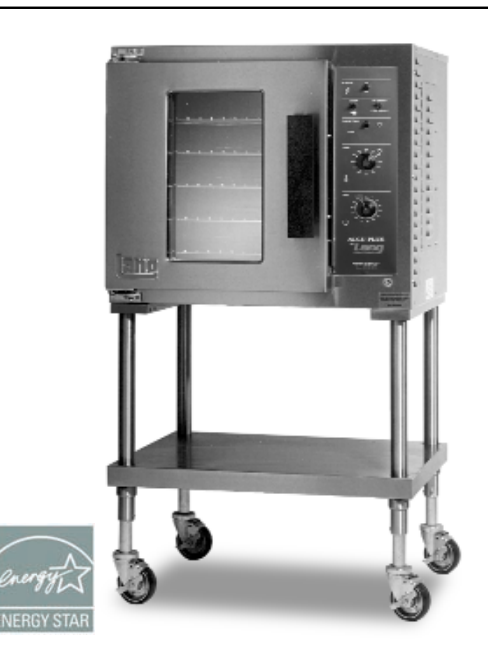
Model ECOH-AP shown, with optional 28" stand.