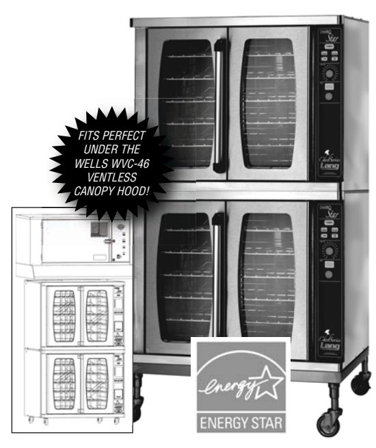
Model ECSF-ES2 shown