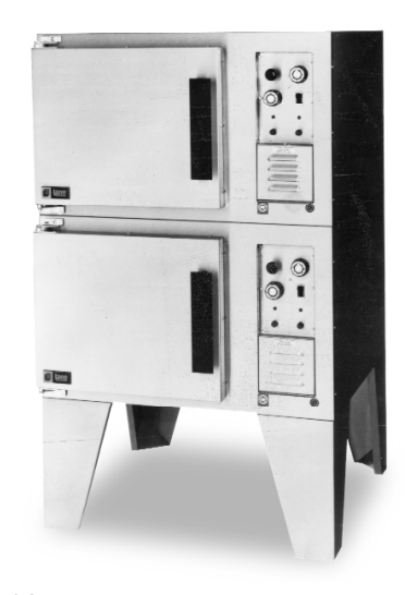
Model FCOF-AT2 shown, with optional angular legs