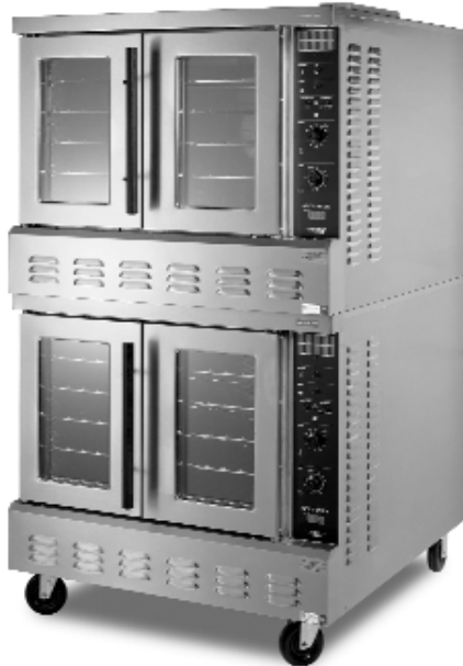
Model GCOF-AP2 shown