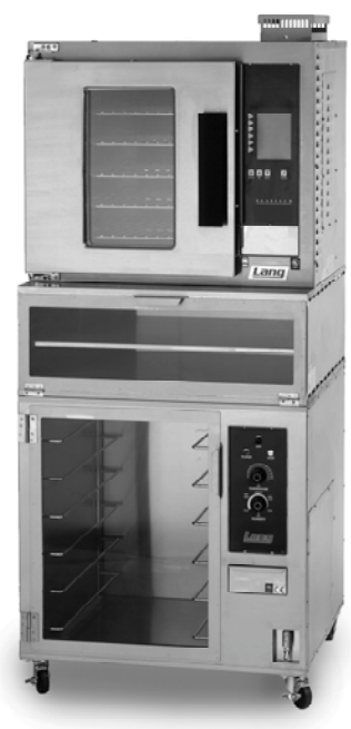
Model MB-PT shown