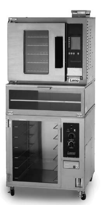
Model MB-PT shown