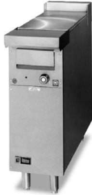
Model R12-ATG shown