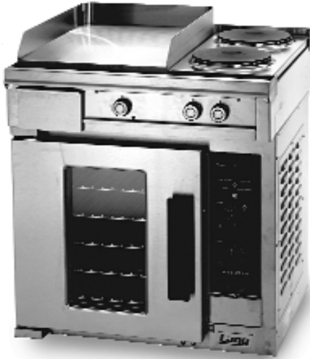
Model R30C-APD shown