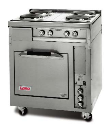
Model R30S shown