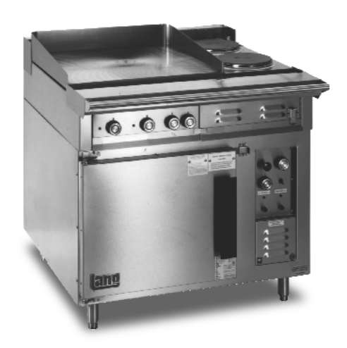
Model R36C-ATA shown