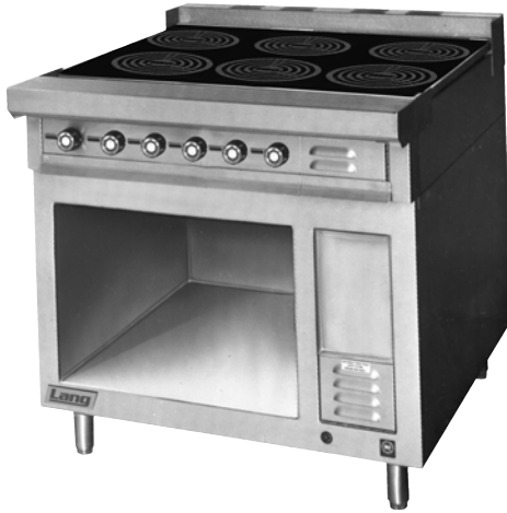
Model RI36B-ATE shown