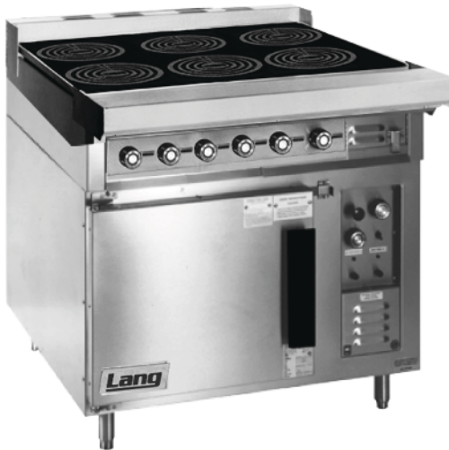
Model RI36C-ATE Shown