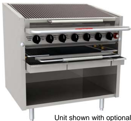
Unit shown with optional lower rack