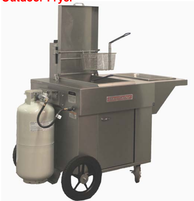
Shown with optional Dump Station