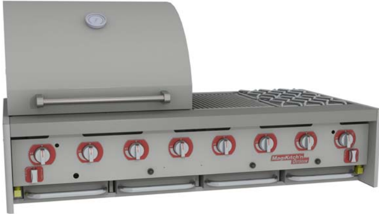
MKO60 Shown with optional Hood, Griddle, & Side Burners