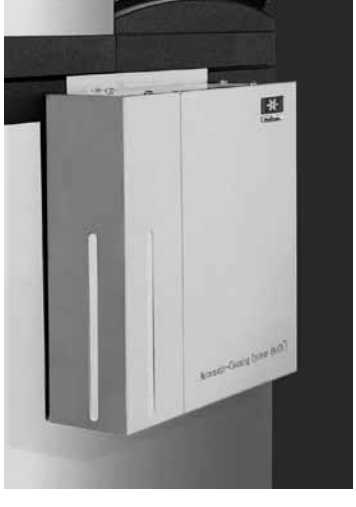
AuCS - SI (Internal Mounting)