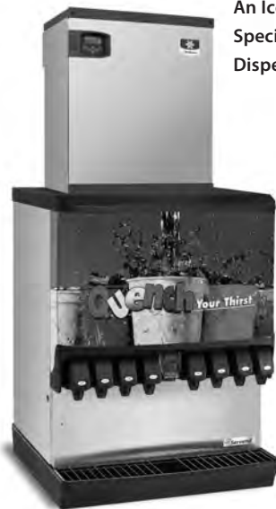
An Ice Machine Designed Specifically for Beverage Dispensers