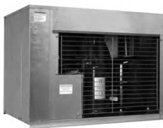
CVD Condensing Unit - 208-230V

QuietQube ice machine with CVD condensing unit is designed as a Manitowoc system and cannot be used with any other ice machine or remote condenser brand.