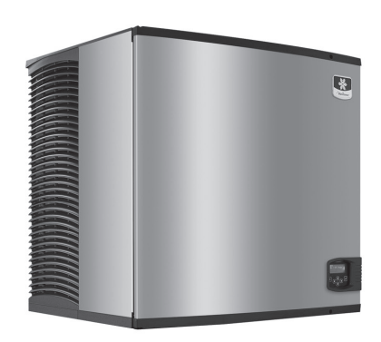
ID-0976C Ice Cube Machine - 115V