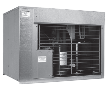
CVD Condensing Unit - 230V