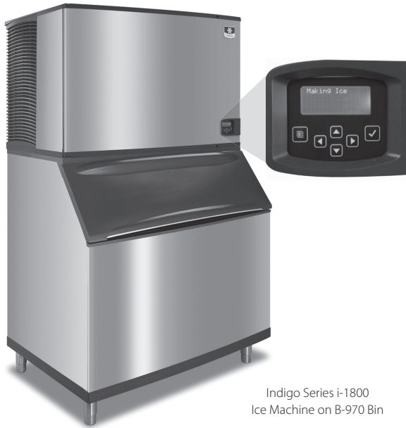
Indigo Series i-1800 Ice Machine on B-970 Bin

Model: IR-1800A ID-1802A IR-1890N ID-1803W IY-1804A IY-1805W IY-1894N ID-1892N