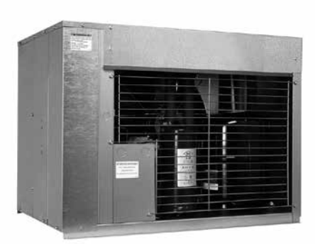
ICVD Condensing Unit 208V