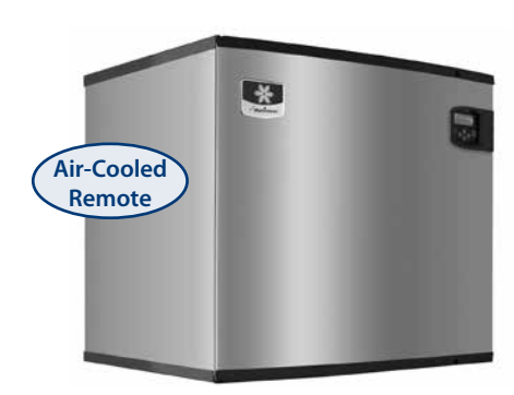
ID-2176C Ice Cube Machine - 115V