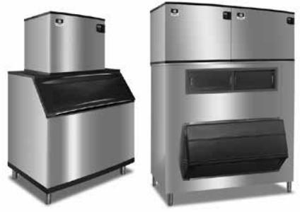
ID-2176C Ice Machine on a B-970 Bin