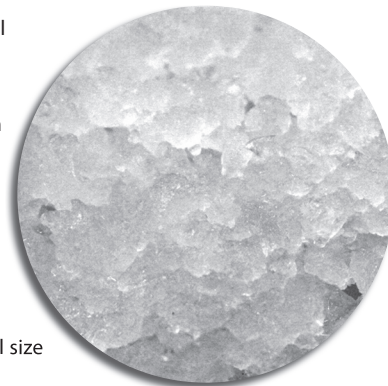
Ice shown actual size

Flake ice is small hard bits of ice ideally suited for presentation applications.