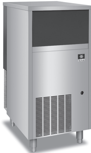
Model RF-0266A Flake Ice Machine