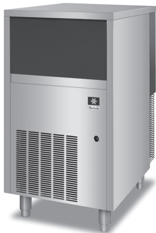
Model RF-0244A Flake Ice Machine