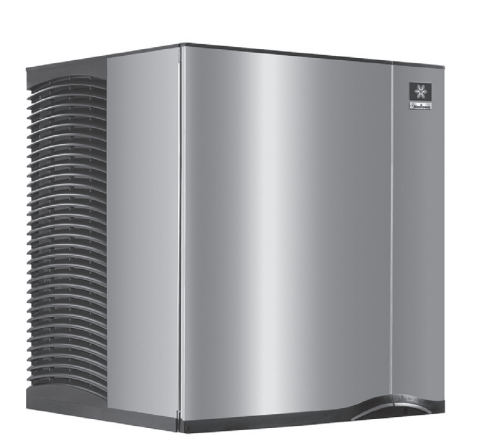
RN-1278C Remote Nugget Ice Machine - 115V