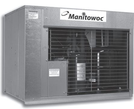
RCU Condensing Unit - 208-230V