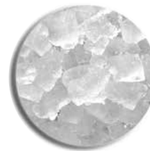
Ice shown actual size

Nugget ice consists of small pieces ranging from 3/8" to 1/2" in width and length on average. Offers a 90% ice to water ratio with a soft, chewable texture while still providing maximum cooling effect and great dispensability.