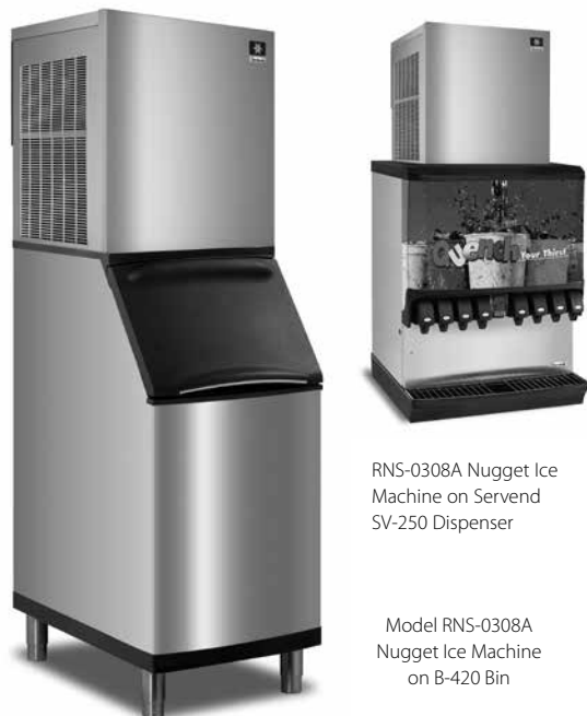
RNS-0308A Nugget Ice Machine on Servend SV-250 Dispenser