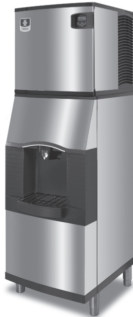
Indigo Series 522 Ice Machine SPA-160 Ice Dispenser

Ice only dispense, with coin-op and room card dispensing control options