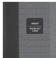
Room Card SRA-164