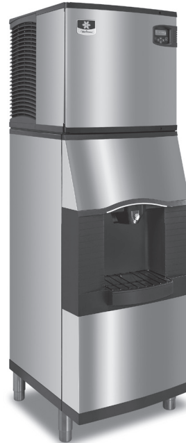
Indigo Series 522 Ice Machine SFA-191 Ice & Water Dispenser