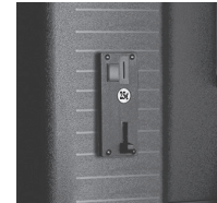
Coin-Op SCA-163 25-cent coin standard.